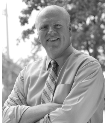
Congressman Joseph Crowley 14 th Congressional District

Paid for and authorized by Crowley for Congress http://www.facebook.com/JoeCrowleyNY http://www.crowleyforcongress.com