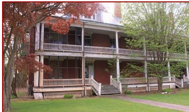
CWNY's Resource, Conference and Educational Center 207 Totten Ave, Fort Totten, NY