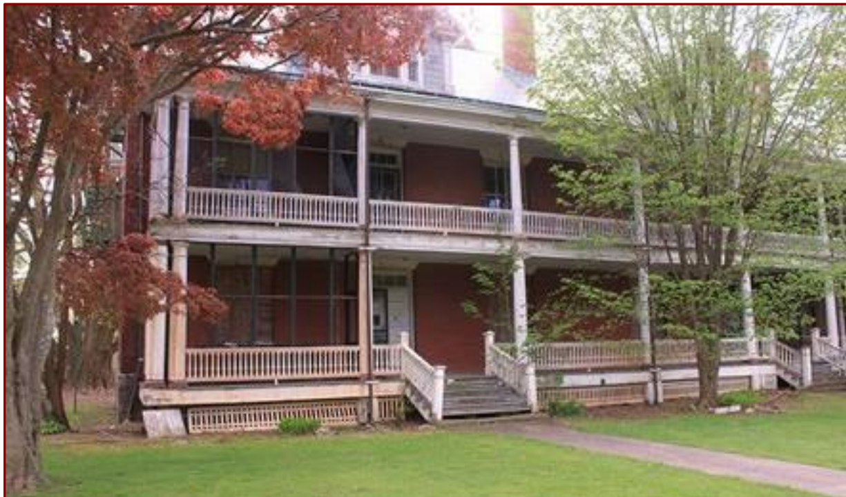
CWNY's Resource, Conference and Educational Center 207 Totten Ave, Fort Totten, NY

The Center for the Women of New York continues the historic fight for women's rights and forms a continuous link with Seneca Falls